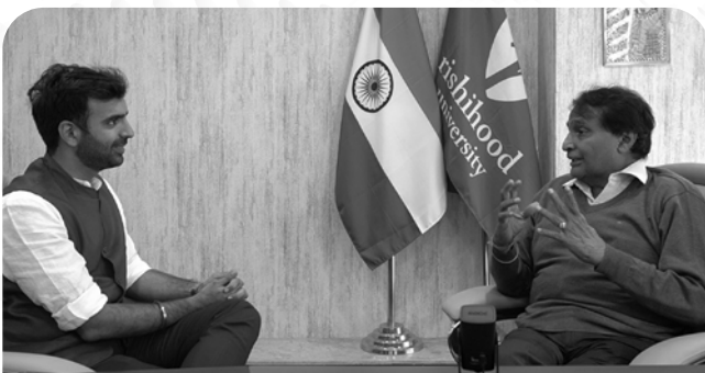
rishikood university Mr. Suresh Prabhu, Hon. Former Cabinet Minister & Chancellor