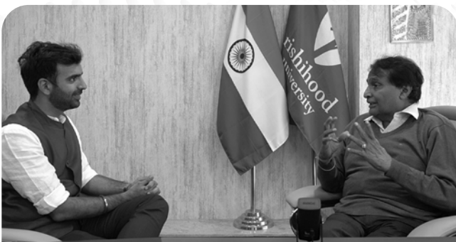
rishabh university Mr. Suresh Prabhu, Hon. Former Cabinet Minister & Chancellor